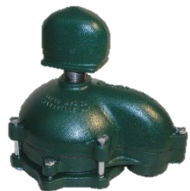
PREMIUM WATERTIGHT CAPS WITH SCREENED AIR VENT

* 1 1/4" Conduit Tapping For personalization of ABS caps, please add $1.00 per cap to the list price. Note: There is a $100 charge for new personalization designs and revisions. * Minimum order qty = 30 caps