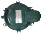
LOCKING WELL CAP IMPORT/DOMESTIC