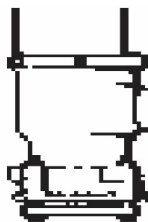
**Kwikonect Style Pressurized